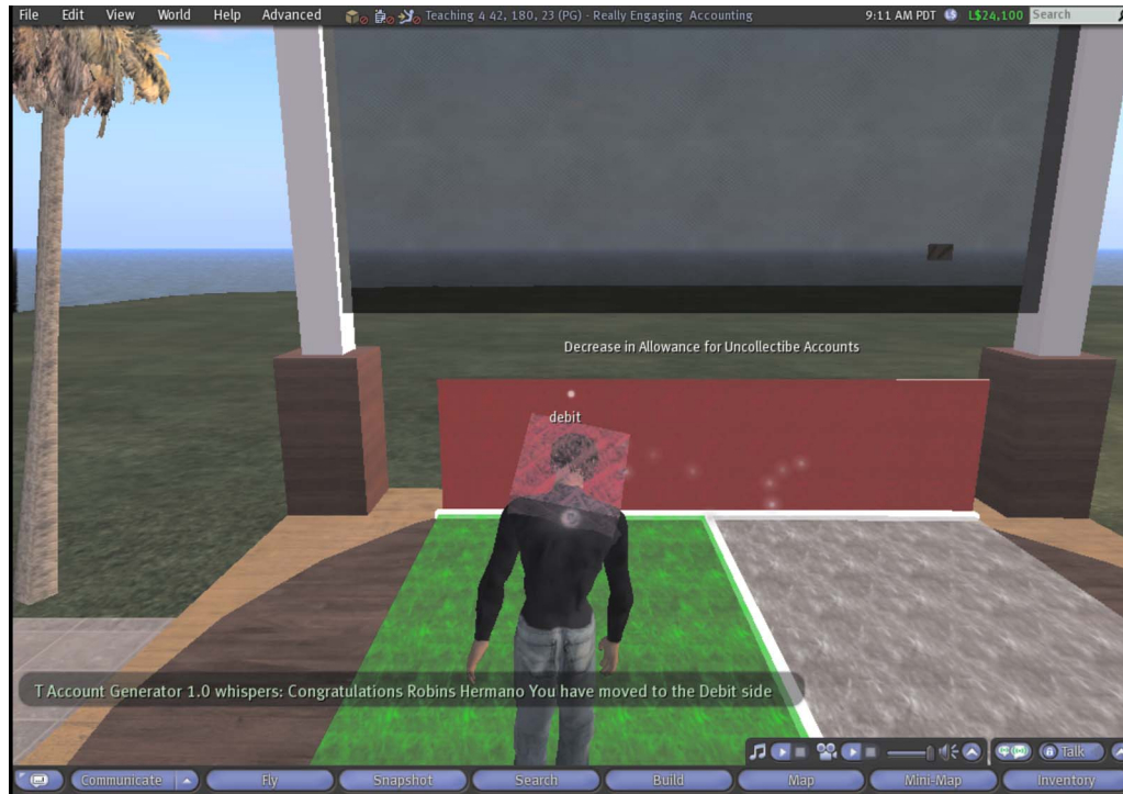
FIGURE 6 Interactive T-Account

increasing or decreasing. Upon receiving this information the student would become a debit or credit—facilitated via a cube attached to their heads—and step on the correct side of the t-account to reflect the proper accounting treatment for the account. Students would receive feedback from the model (in the form of text chat and flashing color—green for correct, red for incorrect) indicating if they were positioned on the t-account correctly and of the proper type, debit or credit. If they were not, the model would provide feedback on the error (they were on the wrong side or they were the wrong type for the side they were on) and the students could make the correction and ask for feedback from the model again.